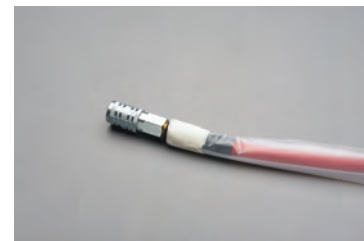
Taped-off "Sleeve" end