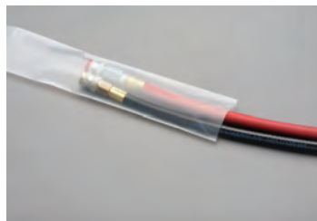
Inserting into "Sleeve"

Slips on over 3/8" spray gun and breathing air-supply hoses.