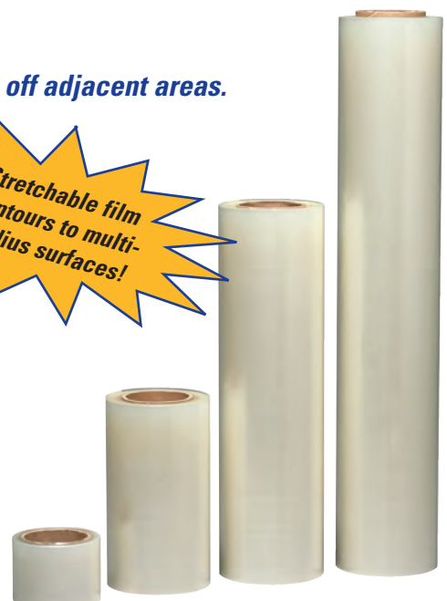
2" width #271 6" width #275 12" width #271 18" width #272

Seeing the background surface under the film improves the accuracy of laying down drawing lines and cutting out the sharper details of design.