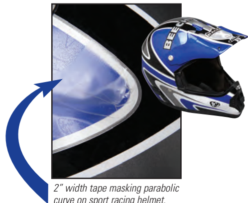
2" width tape masking parabolic curve on sport racing helmet.

2" width is ideal for overlapping tight and multi-radius contours