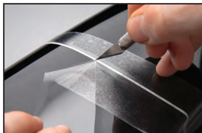
Transparent film improves the accuracy of cutting out sharper details (i.e., cutting the film along the edge of the fine line tape.)

2" width is ideal for overlapping tight and multi-radius contours