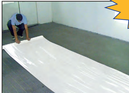
Unrolling "White" film onto booth floor.