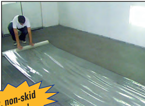
Unrolling "Clear" film onto booth floor.